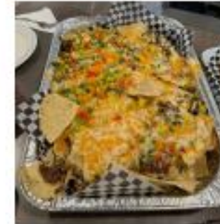
Pub Night Nachos