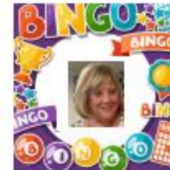
Our Talented Bingo Caller