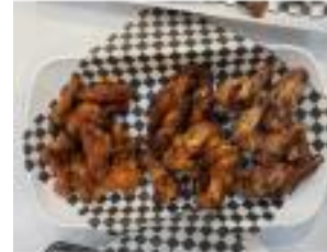
Pub Night Wings