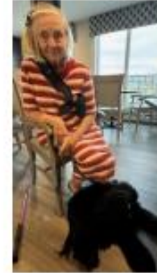
Harvey -Man in Black