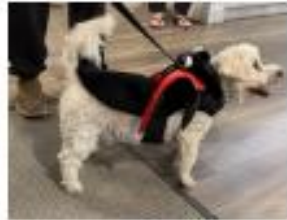
Bev & Buddy