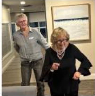
Dancing to music from Band of Brothers