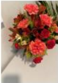
Flowers by Val