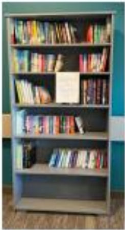
Bookcases built by Woodworking Club