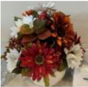
Thanksgiving Flowers by Val