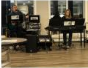
Northern Hearts Band