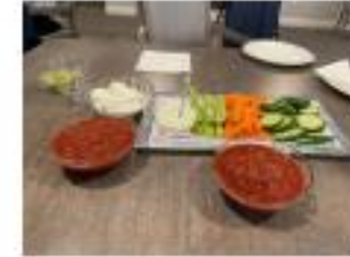
Pub Night Condiments